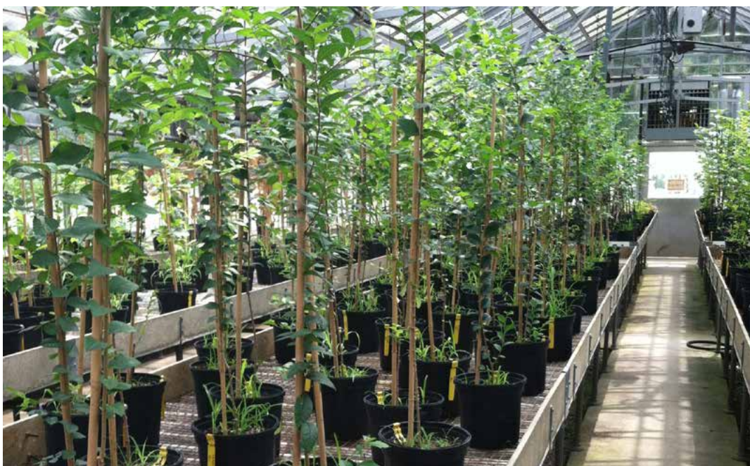
Below: City's greenhouse

Applicable Zoning Regulations: Tree farms are allowed under the city’s “Community garden” and “Harvesting” zoning code regulations.