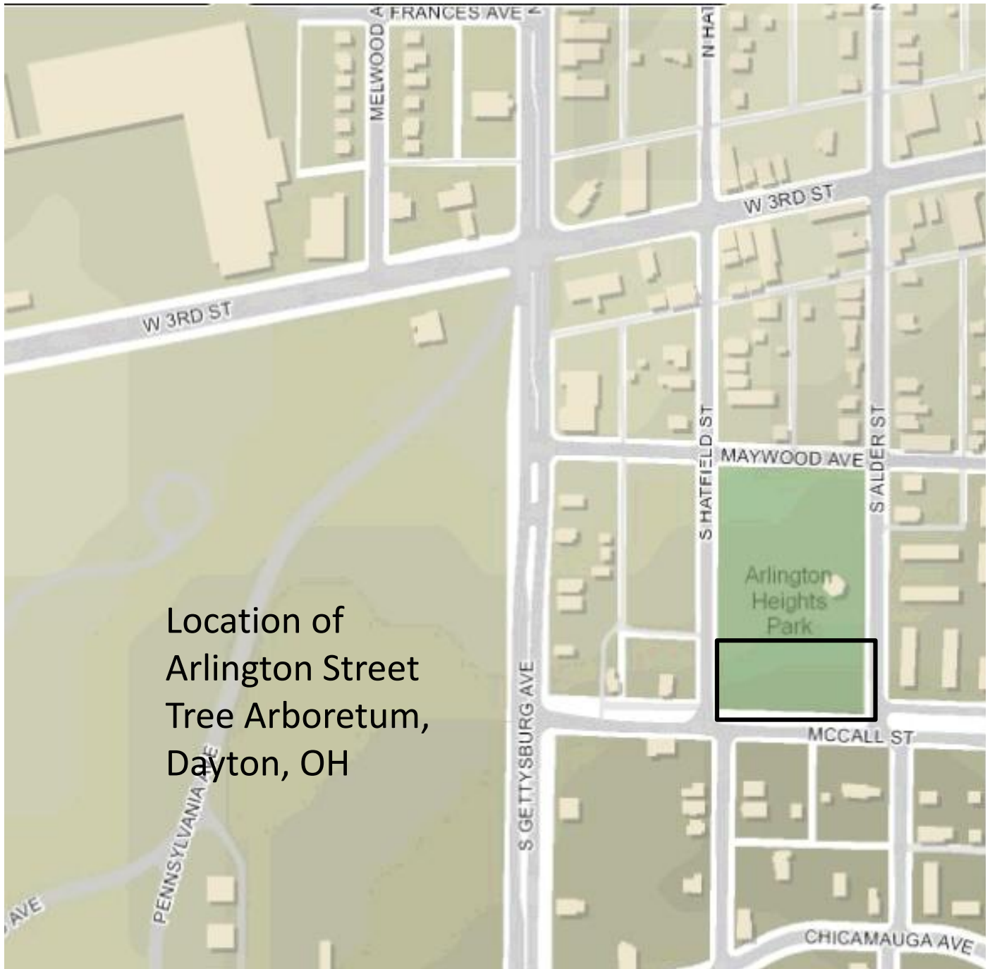
Location of Arlington Street Tree Arboretum, Dayton, OH